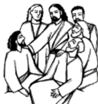
Calling the Twelve to him, he sent them out two by two. Mark 6:7 (NIV)